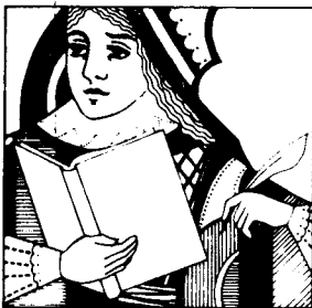
WOMEN'S STUDIES THE UNIVERSITY OF CONNECTICUT

The 5th annual intensive training for women in karate will take place June 25-28 in East Lansing, Michigan. The cost of attending Special Training '81 will be $95.00. This amount covers the cost of room, board and instruction. To reserve your spot, send a check or money order for $25.00, payable to Special Training '81. Mail your deposit to FSDKA, P.O. Box 229, East Lansing, Michigan, 48823 by April 1.