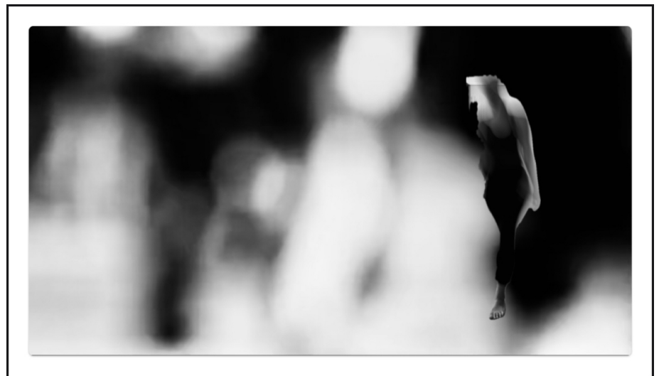
Impairments in Proprioception/Stillness in Motion, photographic collage by author, 2025